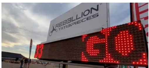
Shows Race Number and GO word – GO blinking for 3 seconds