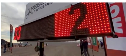
Shows Race Number and last 15 seconds countdown